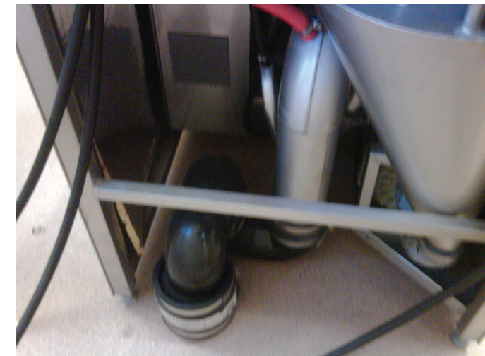
A typical drain connection pictured (above)

*Please note: Failure to set this distance correctly can cause unit to malfunction.