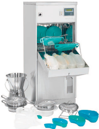
Deko 190 LC pictured (above)